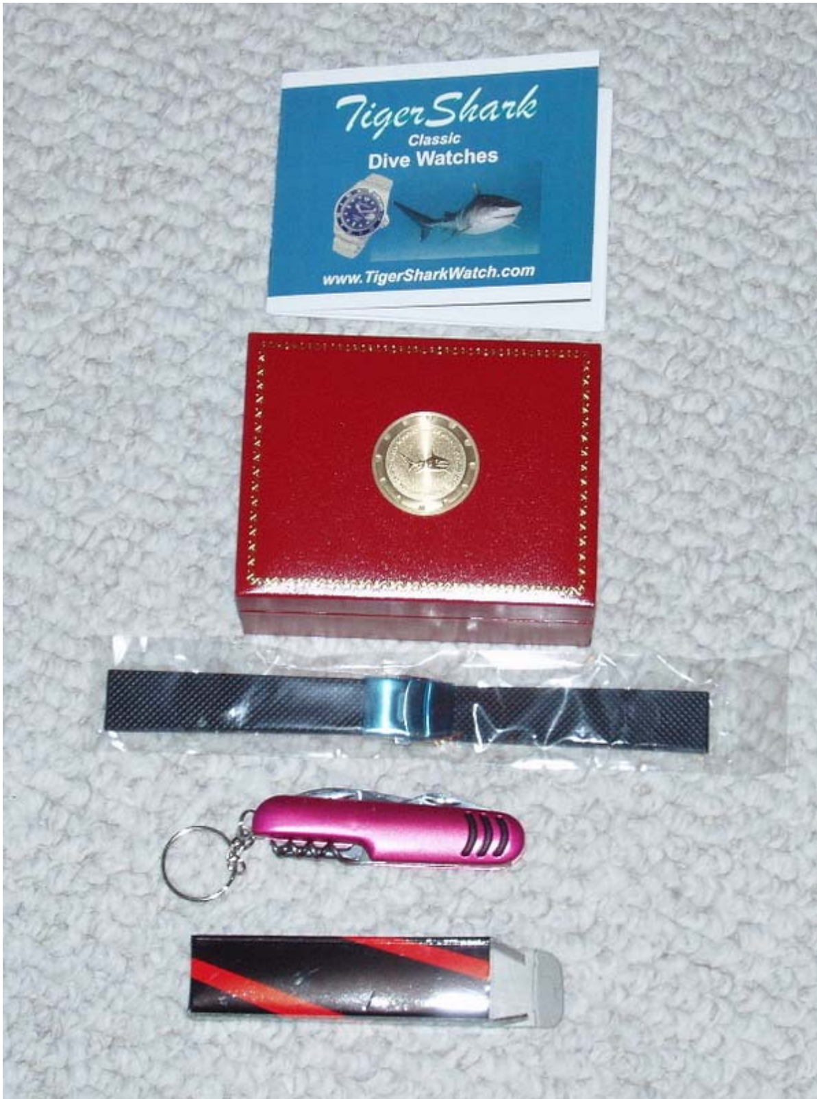
I popped open the box and the TigerShark greeted me.